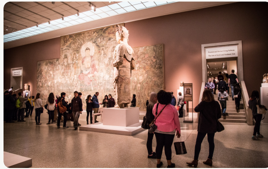
Museum of Art MS2

Take a stroll down the longest pedestrian thoroughfare in Europe, lined with historic buildings and trendy cafes.