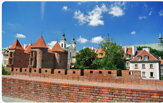
Warsaw Old Town

Climb to the top of the iconic building and enjoy the breathtaking views of the city.