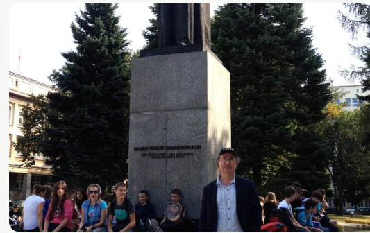
Marie Curie Statue

Stroll through the charming streets lined with picturesque cafes and shops.